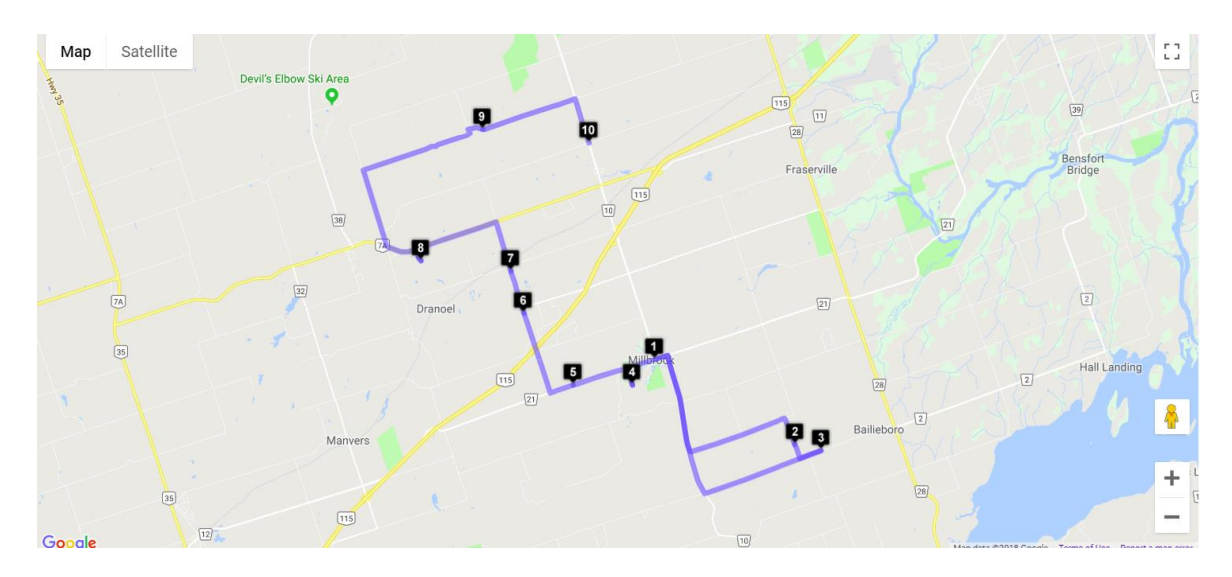
Start - The Quilter's Bolt, 30 King Street East, Millbrook